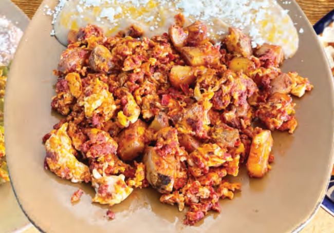
PAPAS CON CHORIZO Y HUEVO