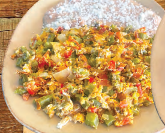
NOPALITOS CON HUEVO