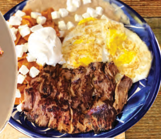
CHILAQUILES WITH STEAK