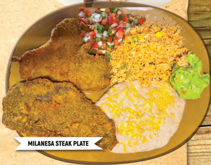
MILANESA STEAK PLATE